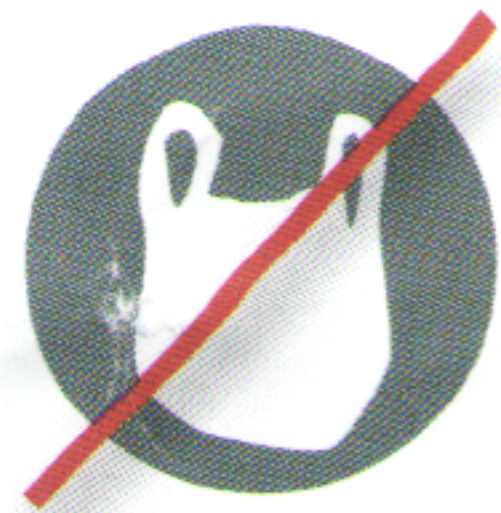
No Plastic Bags or Plastic Wrap (return to retail)