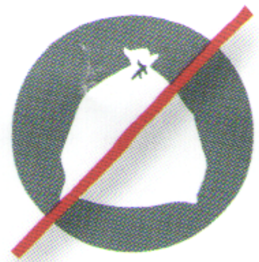
Do Not Bag Recyclables No Garbage