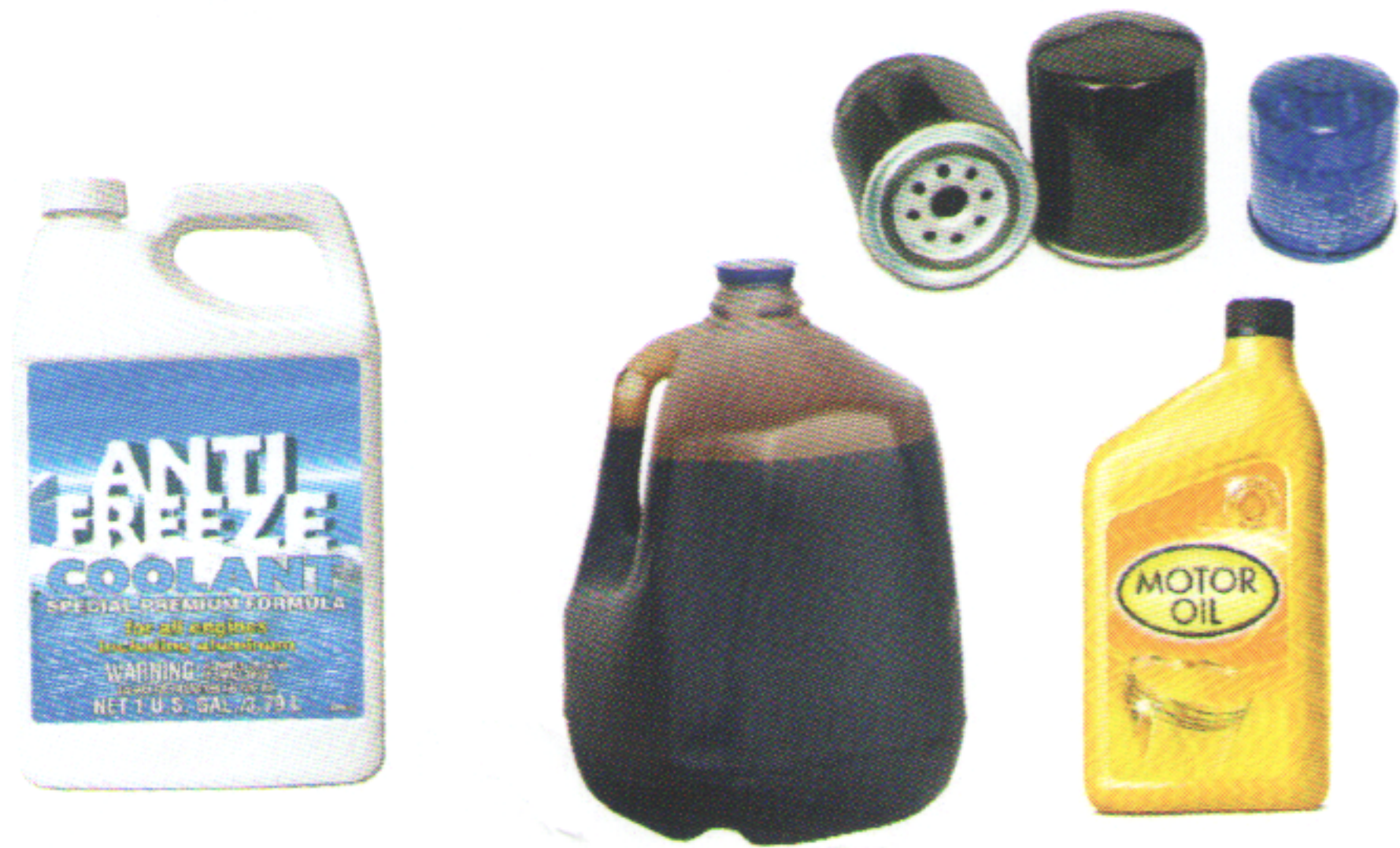
Antifreeze, Used Oil, & Oil Filters (2.5 gallon containers or smaller, no rags or debris)

Fees are associated with some of these materials to cover the cost of proper disposal.