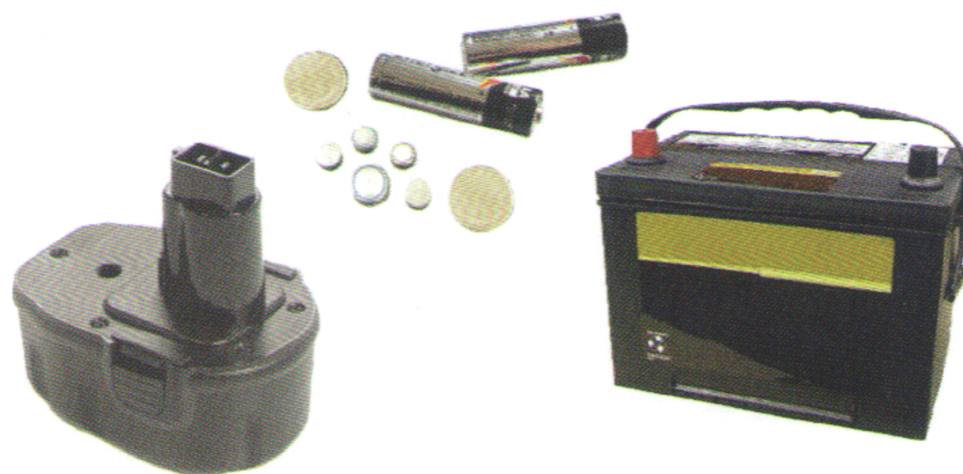
Batteries (tape terminal ends)