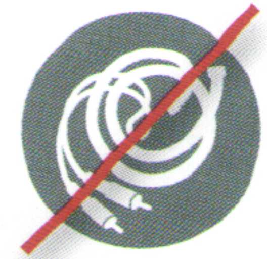
No Tanglers (no hoses, wires, chains, or electronics)