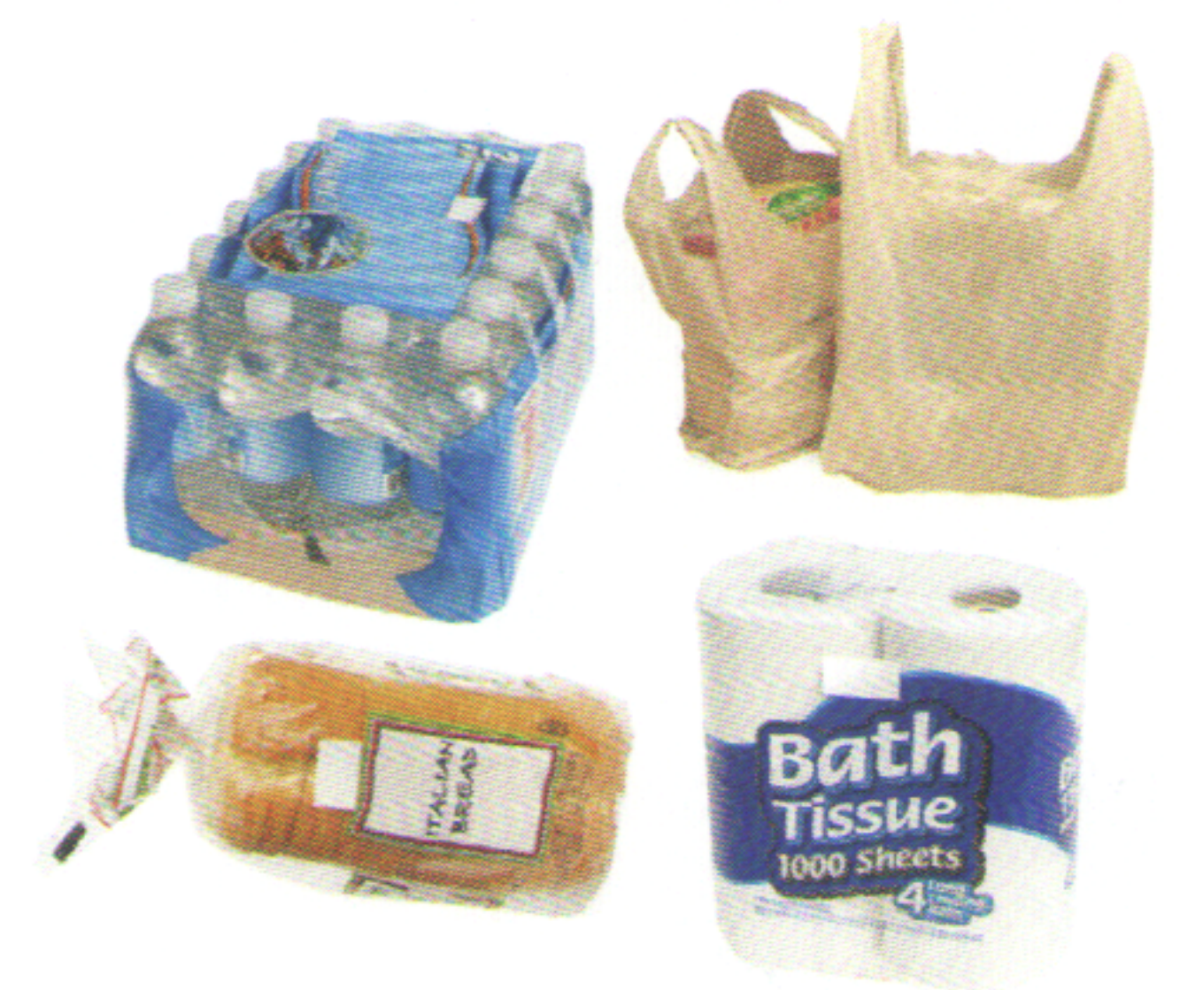
Plastic Film & Bags