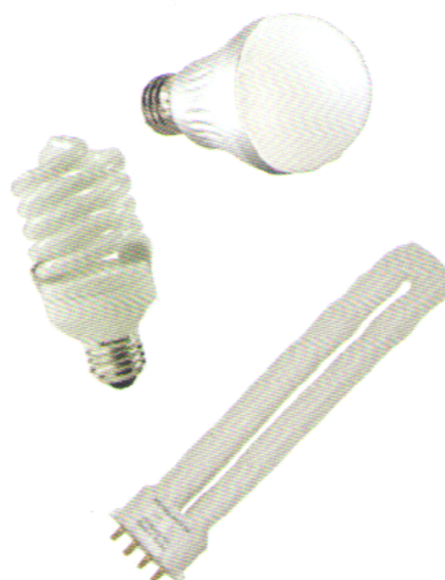
Bulbs, Lamps, & Ballasts