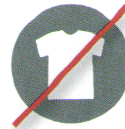
No Clothing or Linens (use donation programs)