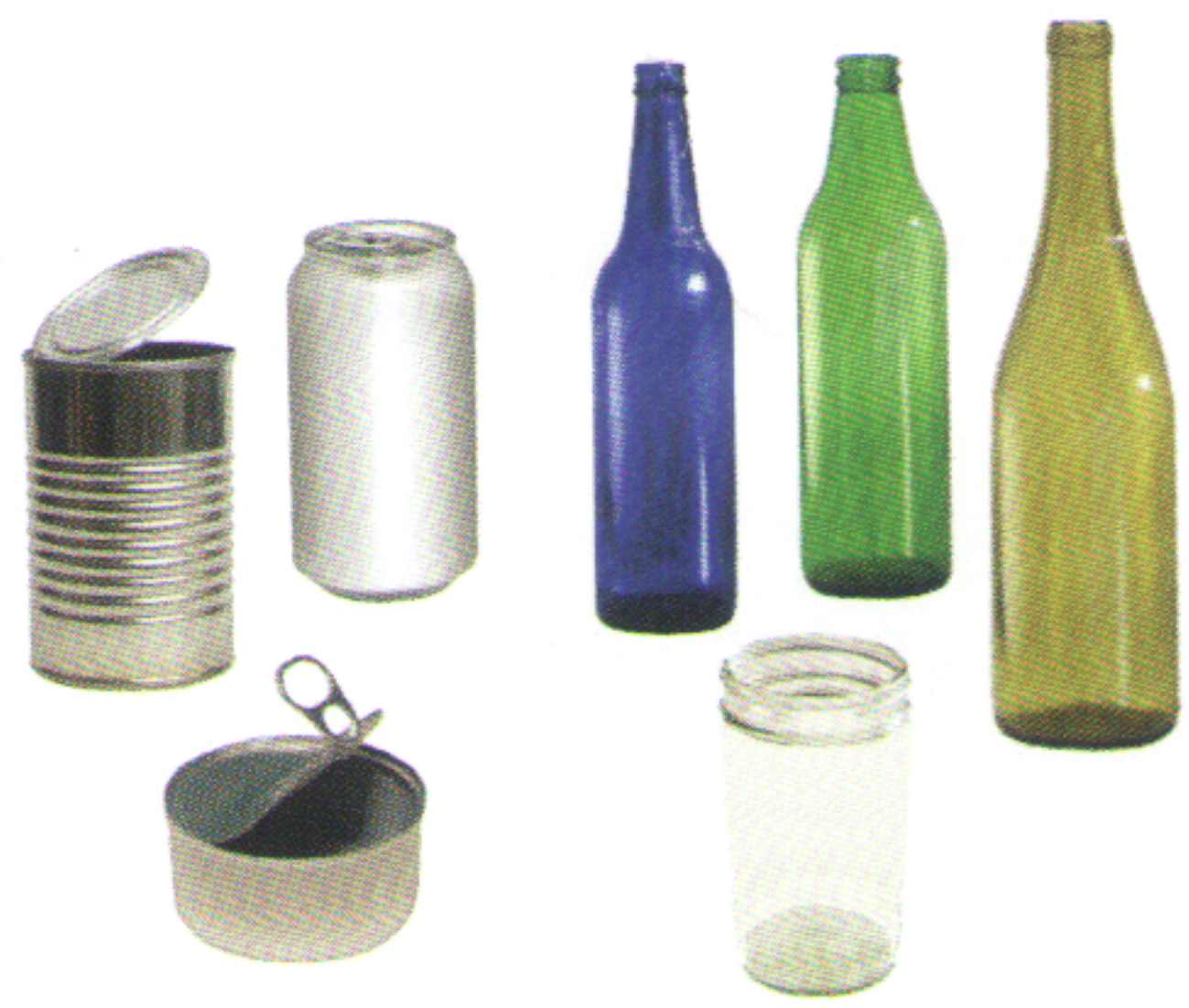
Aluminum & Steel Cans, Glass Bottles & Jars (empty & rinsed, labels can stay on)