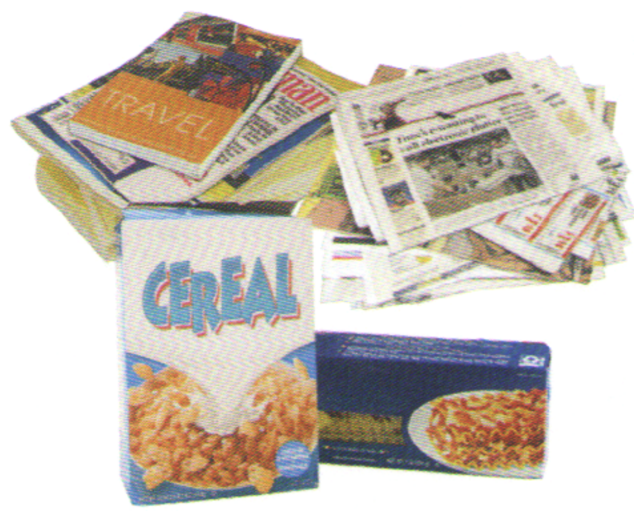
Mixed Paper, Newspaper, Magazines, & Unwanted Mail