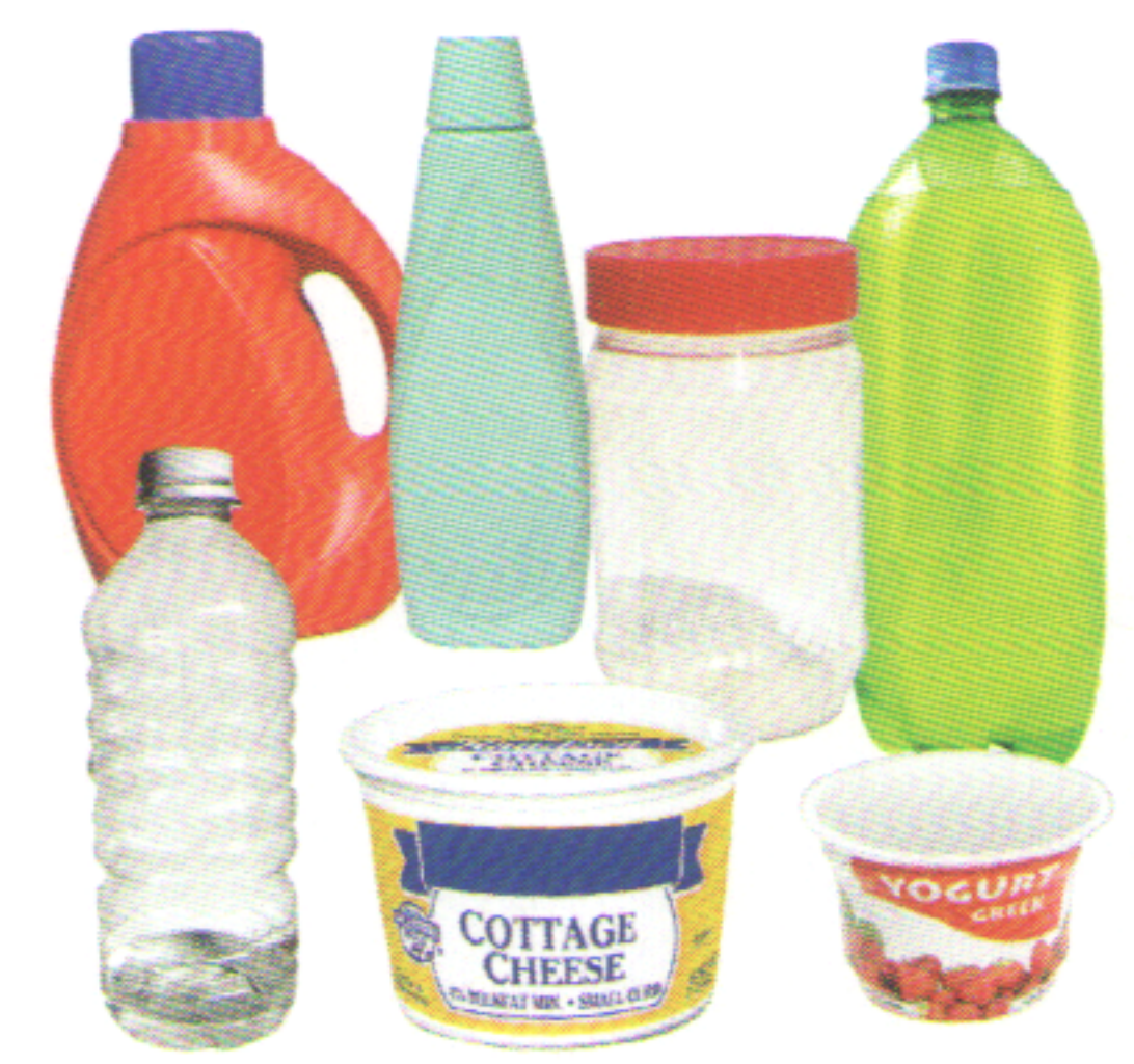
Plastic Kitchen, Laundry & Bath Containers (empty, with cap on)